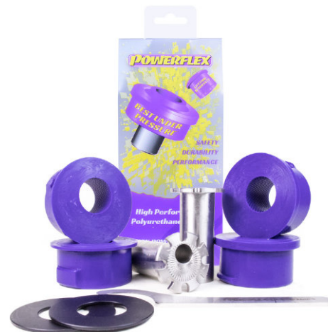
Polyurethane A Bush